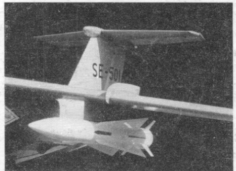
SAAB 105 — armed with air-to-surface missiles. (above) and (below) with 12 rockets.

The SAAB 105 is also suitable for photographic reconnaissance and as a liason/executive aircraft carrying up to five people.