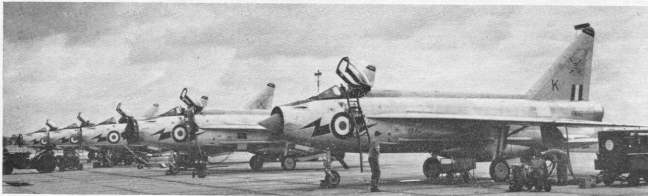
Lightnings of 111 Squadron. The new marking replacing the former black bar consists of a black lightning flash through the roundel outlined in yellow.